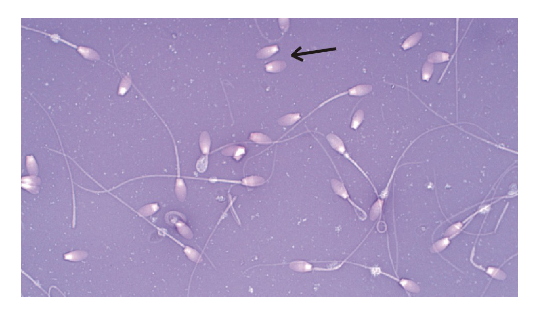
Figure 1. Photograph of spermatozoa in the first ejaculate from the clinical case. Note the abundance of detached heads (black arrow).

The stallion was collected multiple times over the subsequent three days. Semen parameters from those collections are presented in Table 2. Sperm concentration eventually stabilized at around 160 to 200 million sperm per ml and the total motility also stabilized at approximately 60 % by the 8<sup>th</sup> collection. The stabilization of the semen parameters indicate that most of the dead spermatozoa had been removed or 'cleaned out' by the 8<sup>th</sup> collection and we had reached 'daily sperm output'.