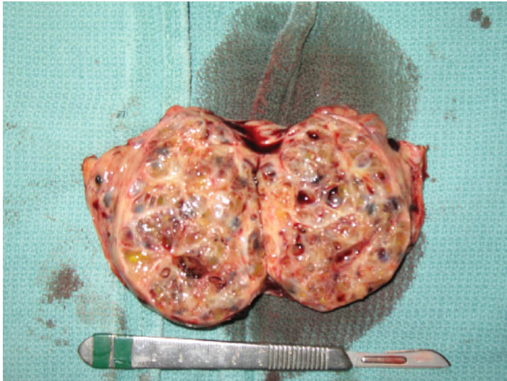
Figure 3. Photograph of the enlarged left ovary after surgical removal.

Surgical removal of the affected ovary was recommended. The enlarged left ovary was removed (Figure 3) and a biopsy was submitted for histopathologic analysis, which confirmed the diagnosis of a granulosa-theca cell tumor (Figure 4).